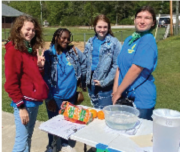
Jr. Leaders waiting on the group of 4-H'ers to arrive so that they can show how an orange float with the peel on sinks when you peel it. They also passed out "Float" wordsearch to each 4-H'er.