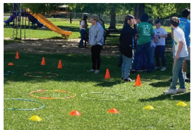
Waiting on the relay races to begin! The 4-H'ers hopped through the hoola-hoops, zig-zagged around the cones and raced back to hand off to their team.